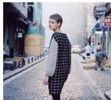
One Piece ¥45,150 by BEARDSLEY Premium,