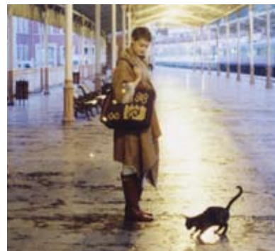
Coat ¥304,500 by caroleFakiel, Tank Top ¥8,295, Pants ¥9,345 all by BEARDSLEY, Bag ¥33,600 by caroleFakiel, Shoes ¥44,100 by GRAFFITE E COLORI