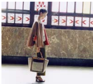
Coat ¥40,950, Blouse ¥15,540, Pants ¥25,200 all by BEARDSLEY Bag ¥71,400 by leApiOperaie, Shoes ¥18,900 by evaluna