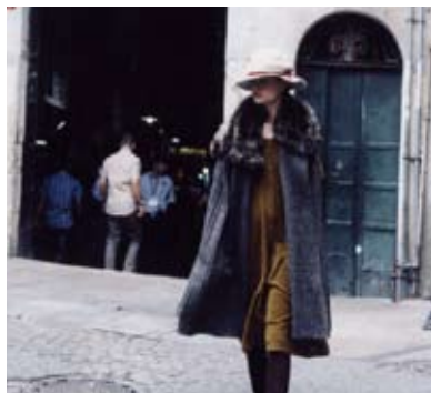
All in One ¥70,350 by BOBOUTIC, Hat ¥50,400 by Muhlbauer, Stole ¥60,900 by caroleFakiel