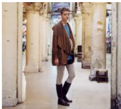
Coat ¥71,400, Knit ¥33,600, Pants ¥16,800, Knit Pants (skirt set) ¥10,290 all by BEARDSLEY, Necklace ¥11,550 by MANU LENA, Shoes ¥38,850 by gidigio