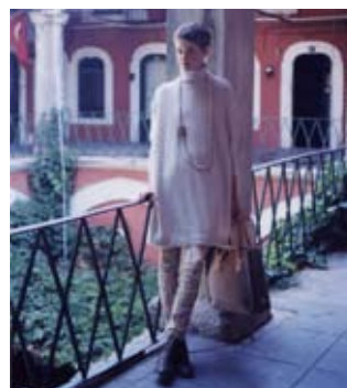
Knit ¥23,100, Pants ¥9,975 all by BEARDSLEY, Necklace ¥19,950 by MADAME REVE, Shoes ¥35,700 by gidigio