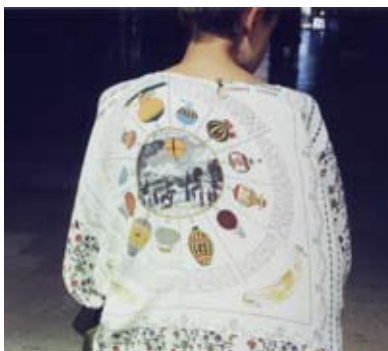
Blouse ¥15,540 by BEARDSLEY