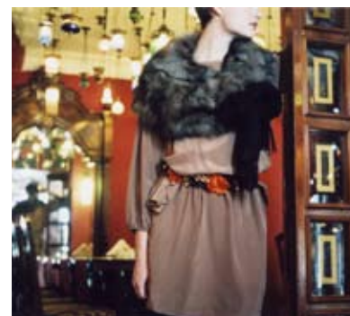
One Piece ¥50,400 by BEARDSLEY Premium, Fur Stole ¥48,300 by BEARDSLEY