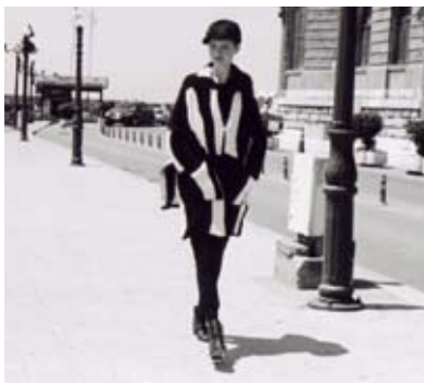
All in One ¥39,900 by BOBOUTIC, Hat ¥21,000 by Anthony Peto, Coat ¥73,500, Shoes ¥35,700 by gidigio