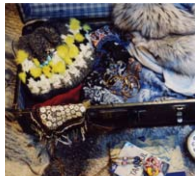
Fur Stole ¥43,050 by Lea Clement, Stole (blue) ¥11,500 by ahujasons, Stole (brown) ¥15,750 by CITRUS, Necklace ¥22,050 by MADAME REVE, Knit Bag ¥29,400 by CLARAMONTE