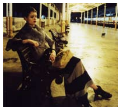
Coat ¥46,200, One Piece ¥18,690 all by BEARDSLEY, Bag ¥14,700 by ANNE BECKER, Shoes ¥35,700 by gidigio