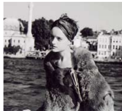
Fur Cape ¥241,500 by CAROLE FAKIEL, Camisole ¥13,650 by MANU LENA, Head Accessory ¥11,550 by EMA...OH