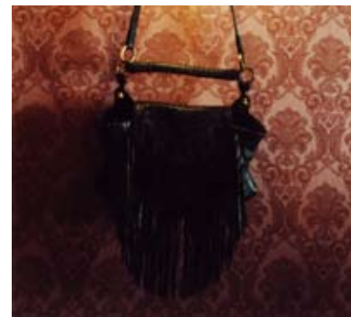
Bag ¥93,450 by SAPAF