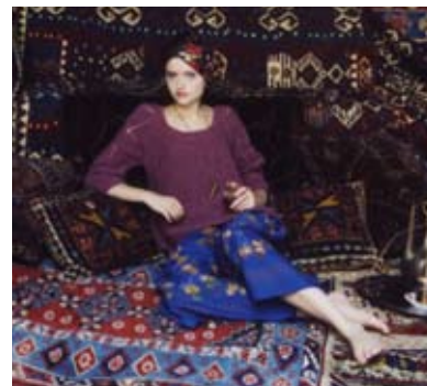
Knit ¥16,800, Pants ¥18,900 by BEARDSLEY Necklace ¥15,750 by caroleFakiel