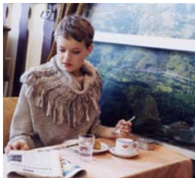
Knit ¥24,150, Pants ¥29,400, Knit Pants (skirt set) ¥10,290 all by BEARDSLEY