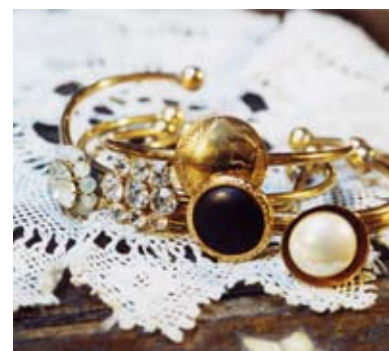
Bangle (pair set) ¥24,150 by MADAME REVE