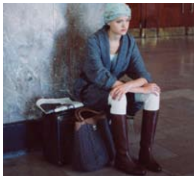
Coat ¥39,900, Tank Top ¥8,295, Pants ¥9,345 all by BEARDSLEY Stole ¥15,750 by IBUH SILK, Bag ¥66,150 by leApiOperaie, Shoes ¥45,150 by GRAFFITE E COLORI