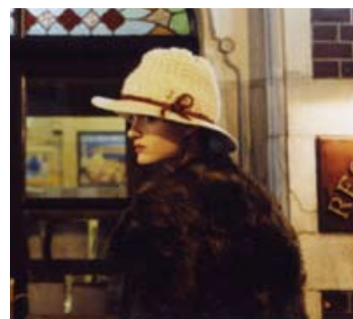
Hat ¥50,400 by Muhlbauer, All in One ¥70,350 by BOBOUTIC