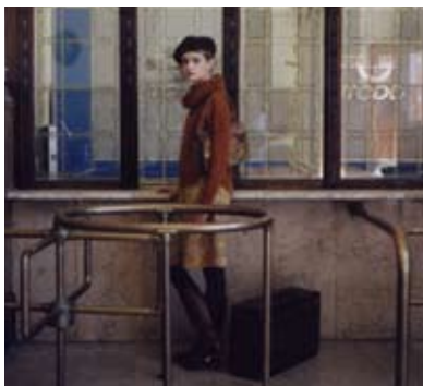
Knit ¥18,900, Pants ¥25,200 all by BEARDSLEY Bag ¥35,700 by CATERINA LUCCHI, Shoes ¥45,150 by GRAFFITE E COLORI