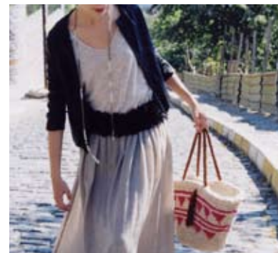
Jacket ¥45,150, Knit ¥16,800, Skirt ¥19,950 all by BEARDSLEY, Bag ¥19,950 by cn shalla, Necklace ¥15,750 by MADAME REVE, Shoes ¥45,150 by GRAFFITE E COLORI